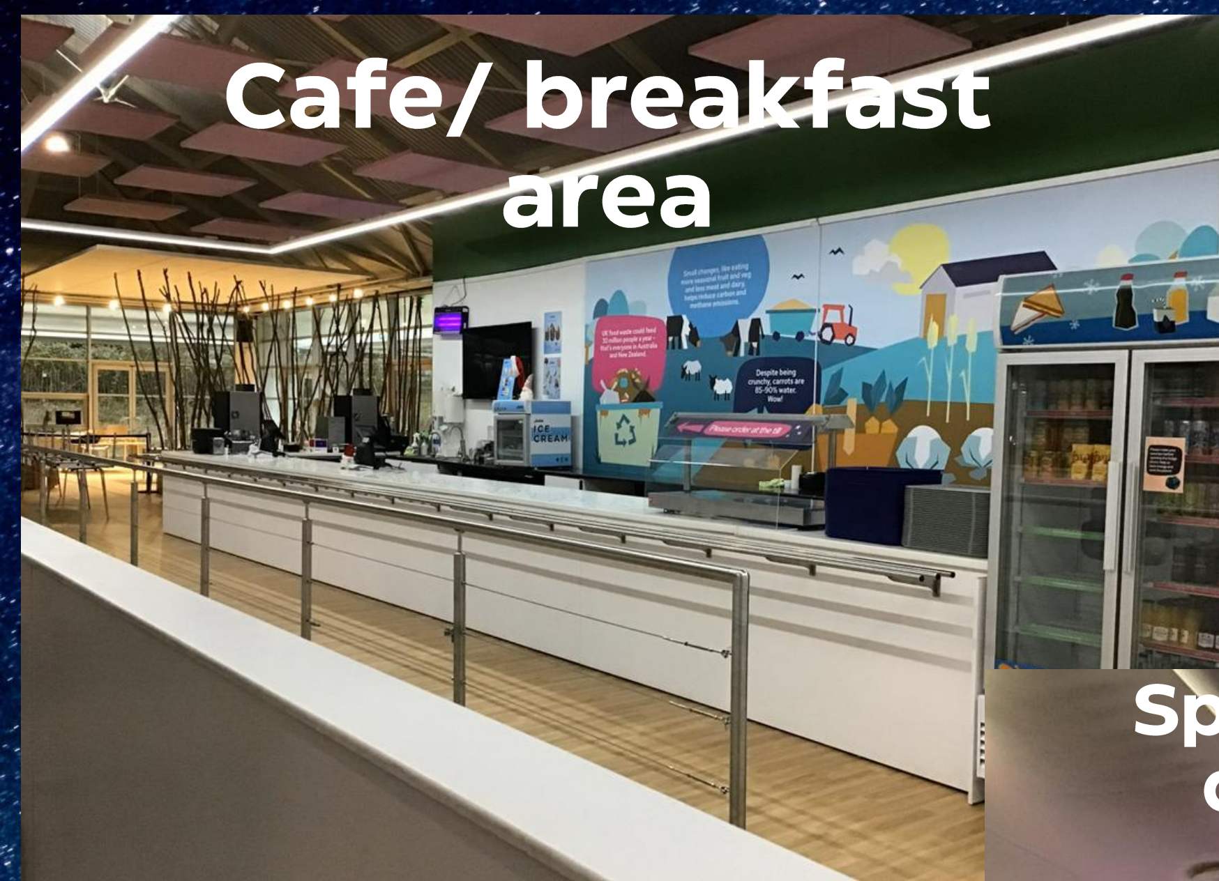
Cafe/ breakfast area