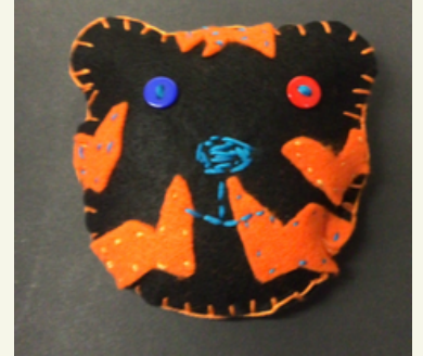
Elodie (Cherry class)