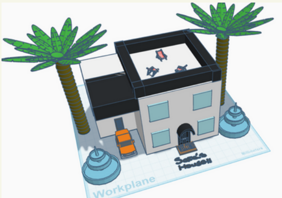
Sara (Cherry class)