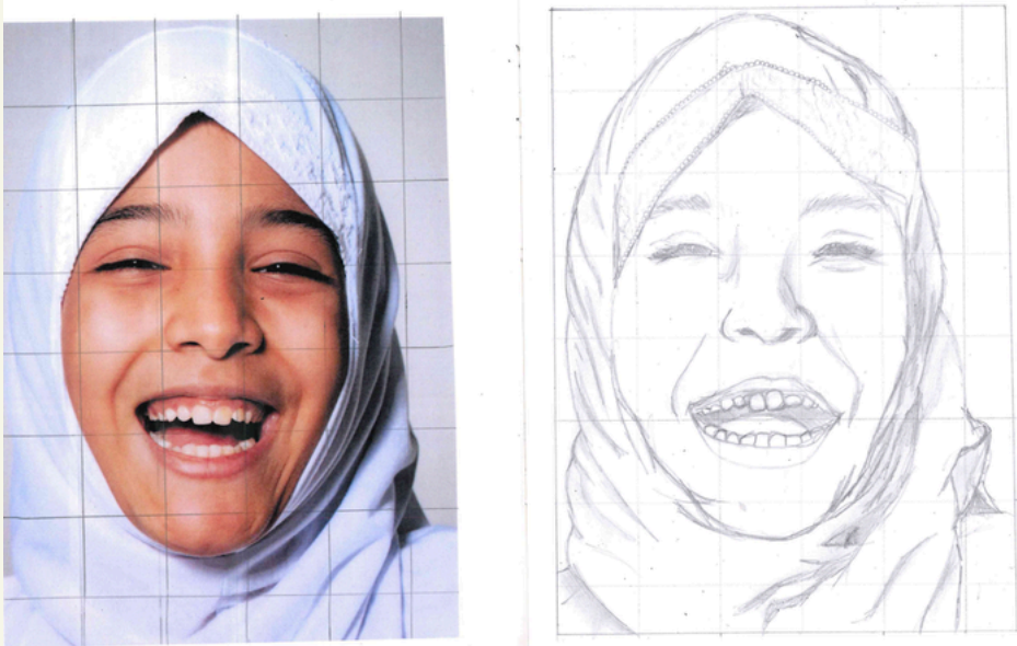
Photorealism (by Kenzie, Spruce class)