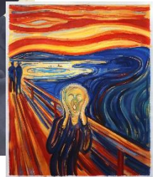
Recreating famous paintings.