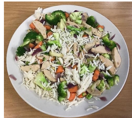
Come Dine with Me – Cookery.