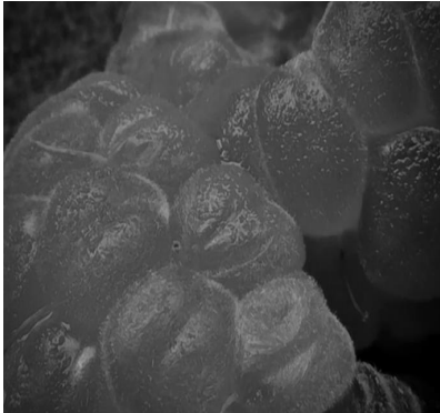
Macrophotography of fruit.

Year 6 would like to show case some of our work in art, DT, cookery and computing that we completed after SATs week. The children showed tremendous talent and enjoyed taking a break from our usual timetable.