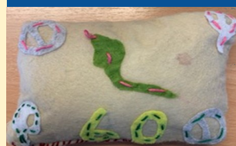
Deadly 60 inspired cushion made in DT by Ethan

They performed a song from one of their music units called 'Dragon Ships' inspired by the Vikings and treated the parents to a short pentatonic melody on the glockenspiels.