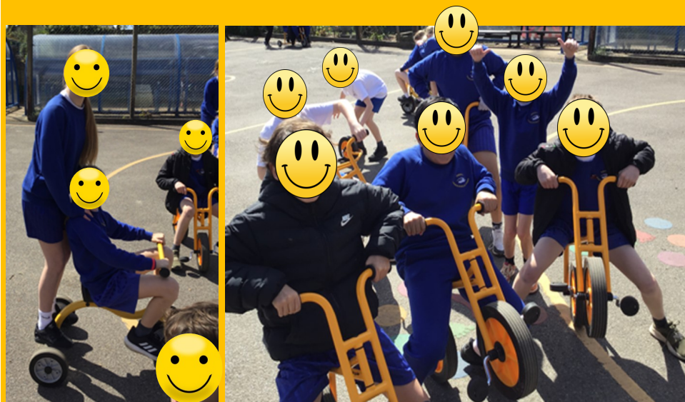
Year 6 children enjoying our new trikes during OPAL play.