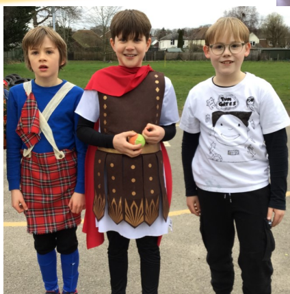
A Nac Mac Feegele, Roman Solider and Tom Gates