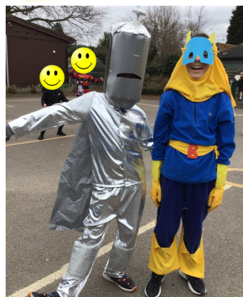
Spaceboy and Bananaman

On World Book, Day we all dressed up and the teachers performed their play. It was really funny because of the twist - I never expected Little Red Riding Hood to end up wearing a wolf skin coat!" - Ava in Cherry class.