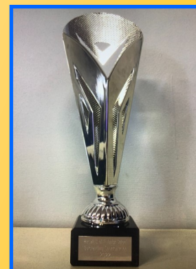
Outstanding Sports Person Dylan, Year 5