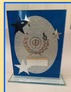
Governors' Award Any, Year 6