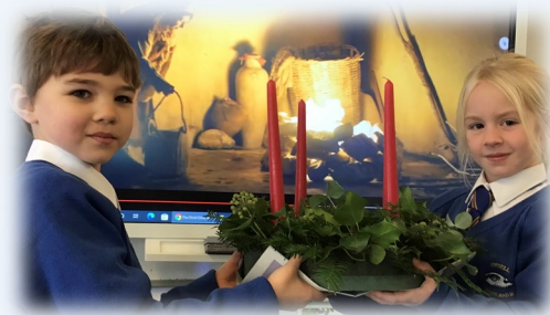
Mrs Broden has created a beautiful advent wreath which is visiting a different classroom each morning.