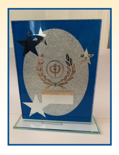
Governors' Award Sydney, Year 6